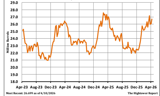
US Weekly Ethanol Stocks