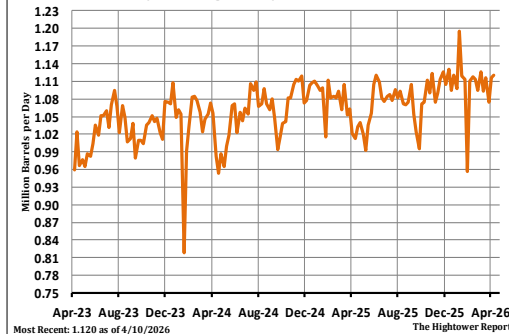
US Weekly Average Daily Ethanol Production