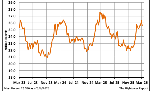
US Weekly Ethanol Stocks