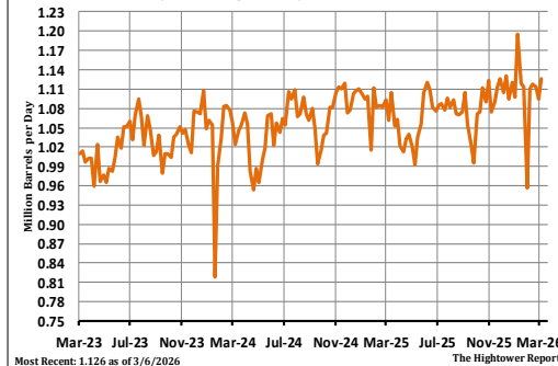
US Weekly Average Daily Ethanol Production